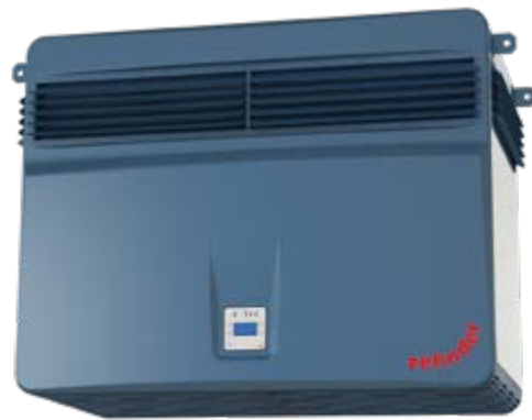
Zehnder CleanAir 6